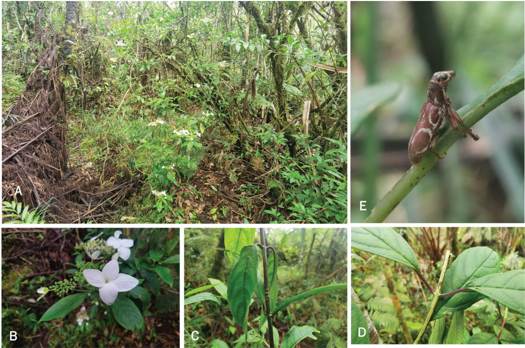
Figure 2. Hydrangea chinensis Maxim.: A: Plant habit, B: Flowers, C-D: Bite patterns of C. lumawigi on H. chinensis , E: Callimetopus lumawigi resting at the petiole of H. chinensis .