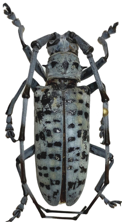
Fig. 12. Pseudonemophas versteegi (Ritsema, 1881).