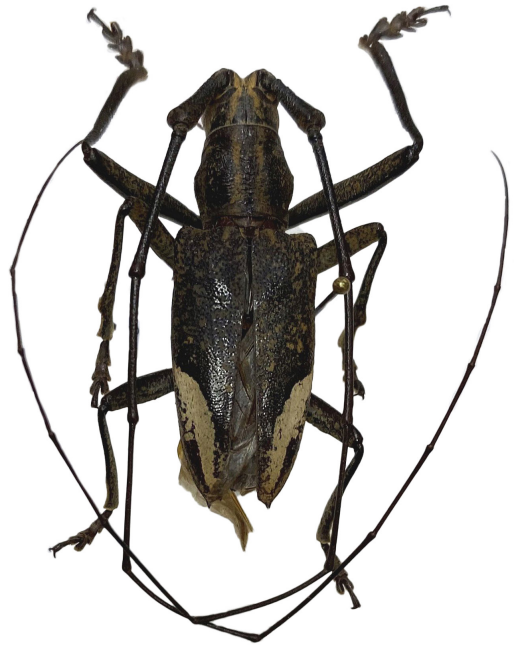
Fig. 10. Pelargoderus rubropunctatus (Guerin-Meneville, 1833).