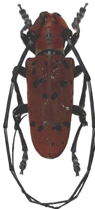
Fig. 8. Eupromus ruber Dalman, 1817

93. Nemophas tomentosus (Buquet, 1859) – Indonesia: West Papua, Arfak Mts., 11.2011 (1, local collector leg.).