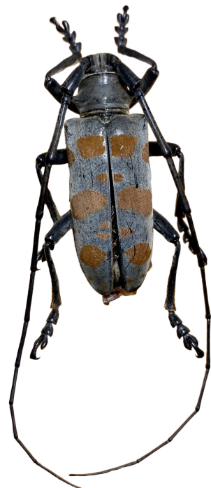
Fig. 5. Dolichoprosopus lethalis (Pascoe, 1866)