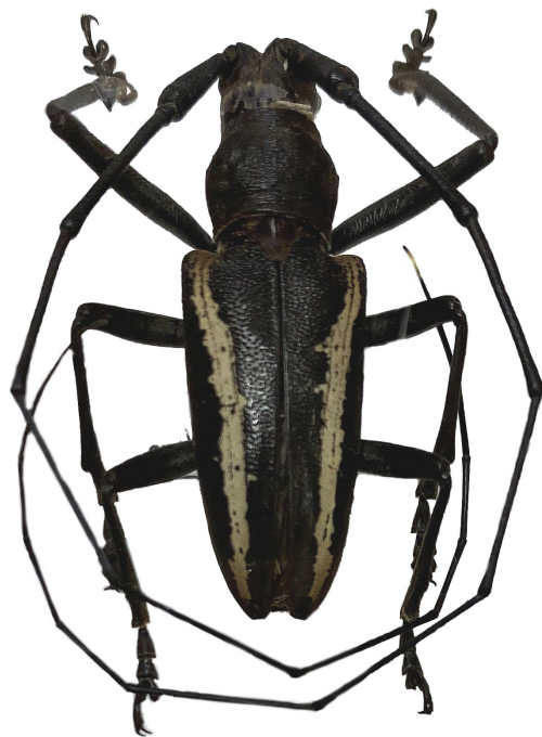
Fig. 11. Pelargoderus vittatus Audinet-Serville, 1835.

Malaysia: Cameron Highlands, Tanah Rata, 05.2009 (1, local collector leg.), 05.2012 (1, local collector leg.); Perak, Holu Perak distr., Lenggong city env., 700 m, 02.06.04.2019 (4, S.Dementiev leg.).