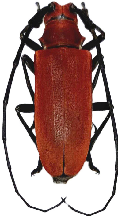
Fig. 7. Eupromus laosensis Breuning, 1968