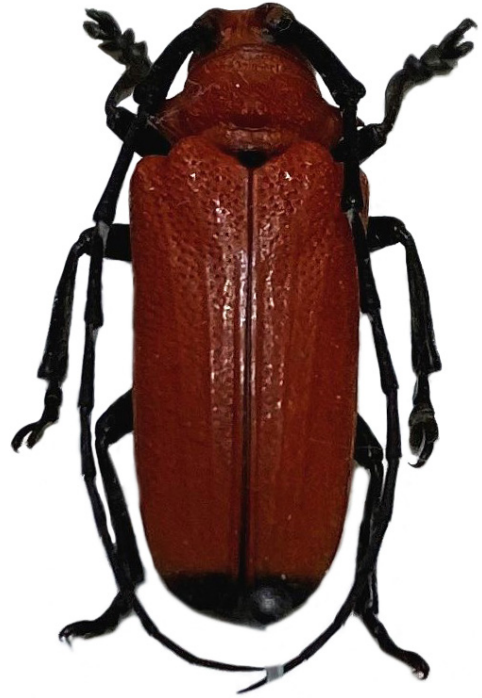
Fig. 9. Thermonotus pasteuri Ritsema, 1890.

Laos: Kiew Mak Nao. 900 m, 04.2014 (1, local collector leg.), 06.2014 (1, local collector leg.).