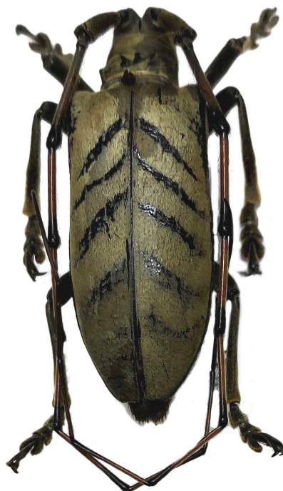
Fig. 1. Cornuscoparia annulicornis Heller, 1897

64. Cyriotasiastes rhetenor rhetenor Newman, 1842 – Philippines: Luzon isl., Bucalan, Calumpit, 10.2018 (1, local collector leg.),