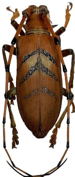
Fig. 4. Cornuscoparia schlaginhaufeni (Heller, 1910)

68. Epepeotes ceramensis (Thomson, 1861) – Indonesia: Moluccas, Seram isl., 800 m, Elpaputih vill., 12.2016 (1, local collector leg.).