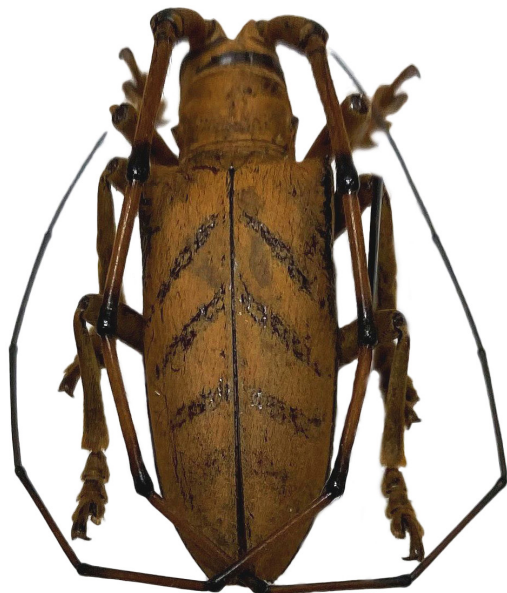
Fig. 3. Cornuscoparia ochracea Jordan, 1894