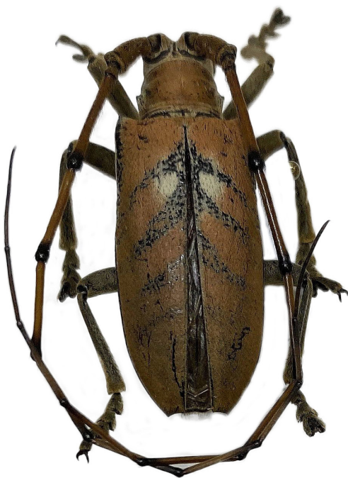
Fig. 2. Cornuscoparia barsevskisi Votsekhovskii, 2020