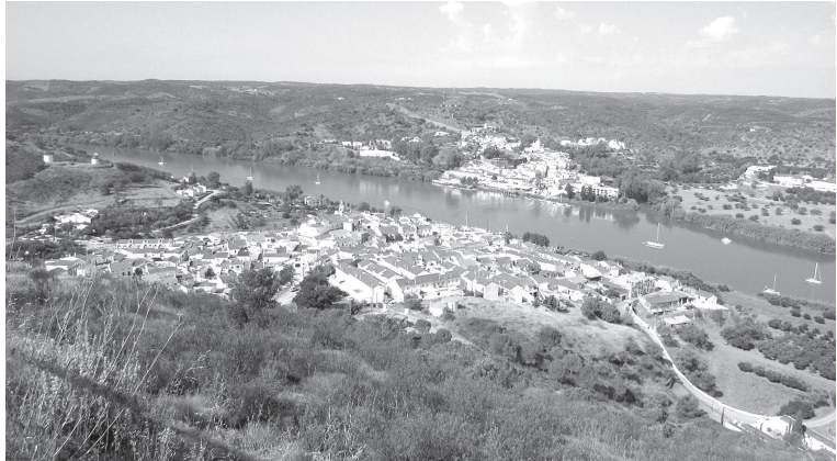
Fig. 2: Alcoutim viewed from the San Marcos Fortress (Sanlúcar de Guadiana).

the attractiveness of fortresses as visible monuments in the landscape, often providing spectacular views of the surrounding territory (see Fig. 2 as an example), other features, such as language or even archaeological records, are equally interesting to researchers. In this context, cross-border tourism is based on the perception of hybridity and cultural diversity, and border tourism is focused on differences, markers of separation and cultural homogeneity (Hernández 2017).