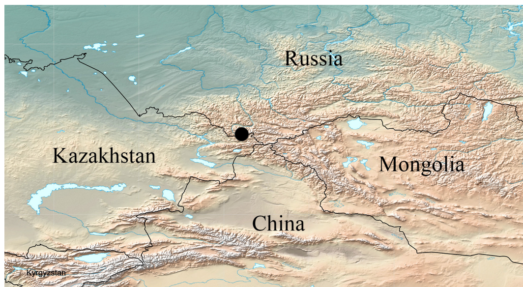
Fig. 1. Black spot – location of the Katunskiy State Nature Biosphere Reserve.

The distribution range for each species is given based on records taken mostly from the World