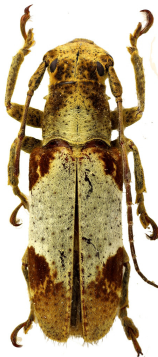
Fig. 2. Holotype of Callimetopus danilevskyi sp. n..