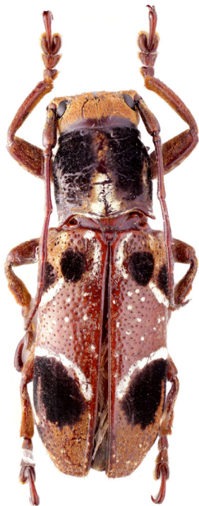
Fig. 6. Callimetopus ornatus Schultze, 1934.