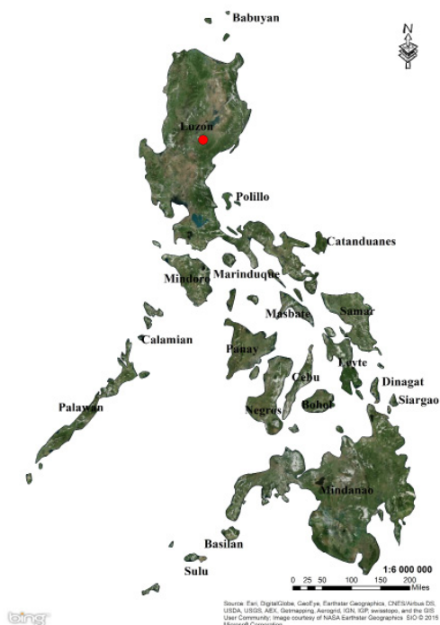
Fig. 1. Distribution map of Callimetopus danilevskyi sp. n.

Description. Body brown, with light luster and dense pubescence. Length: 15.0 mm, width: 4.9 mm.