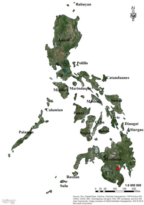
Fig. 3. Distribution map of Callimetopus lazarevi sp. n.