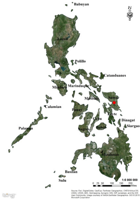
Fig. 5. Distribution map of Callimetopus ornatus Schultze, 1934.