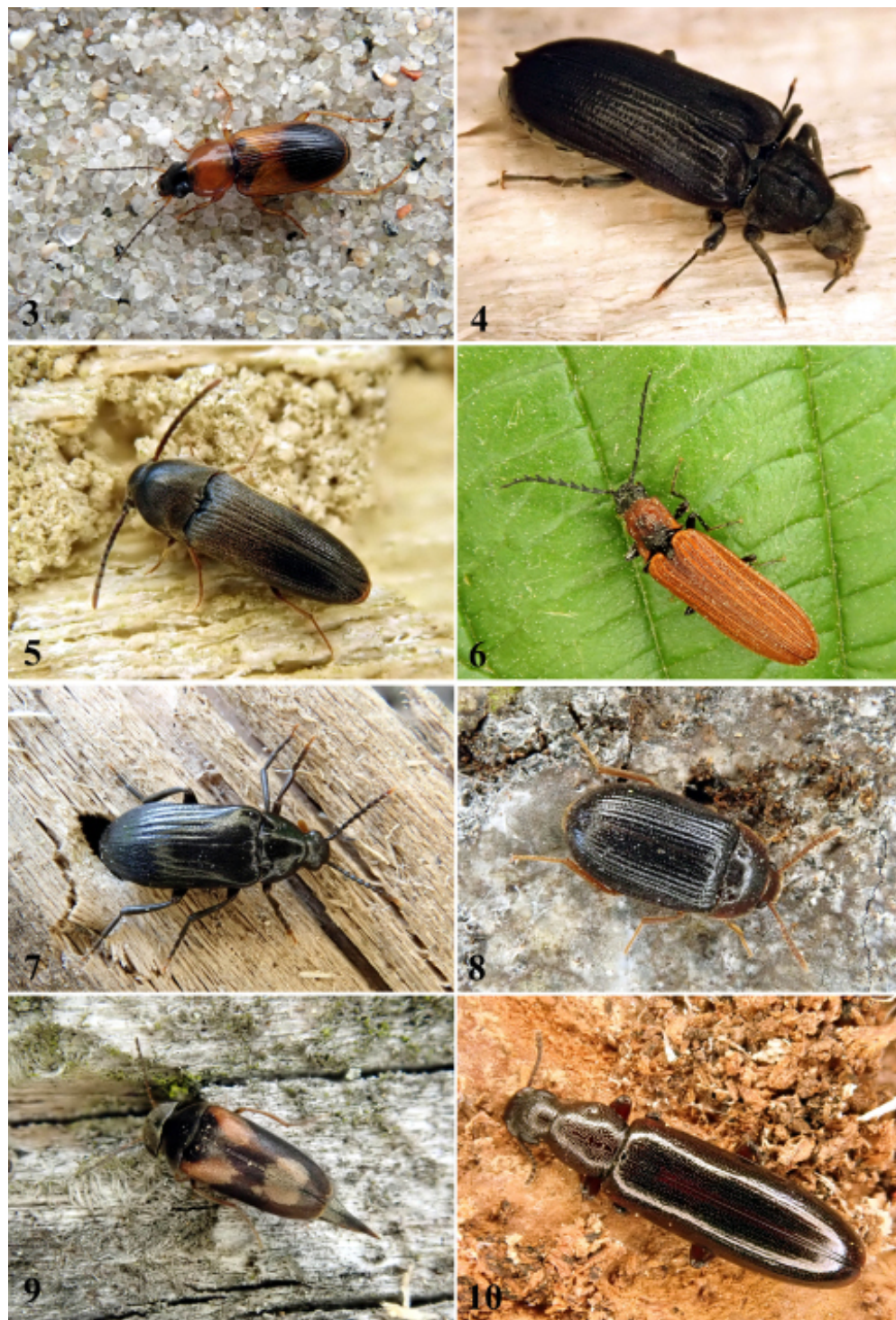
Figs 3–10. The photographs of the living specimens in nature (Kaliningrad Region): 3 – Stenolophus teutonius ; 4 – Potamophilus acuminatus ; 5 – Hylis olexai ; 6 – Denticollis rubens ; 7 – Melandrya barbata ; 8 – Mycetophagus ater ; 9 – Mordellaria aurofasciata ; 10 – Boros schneideri .