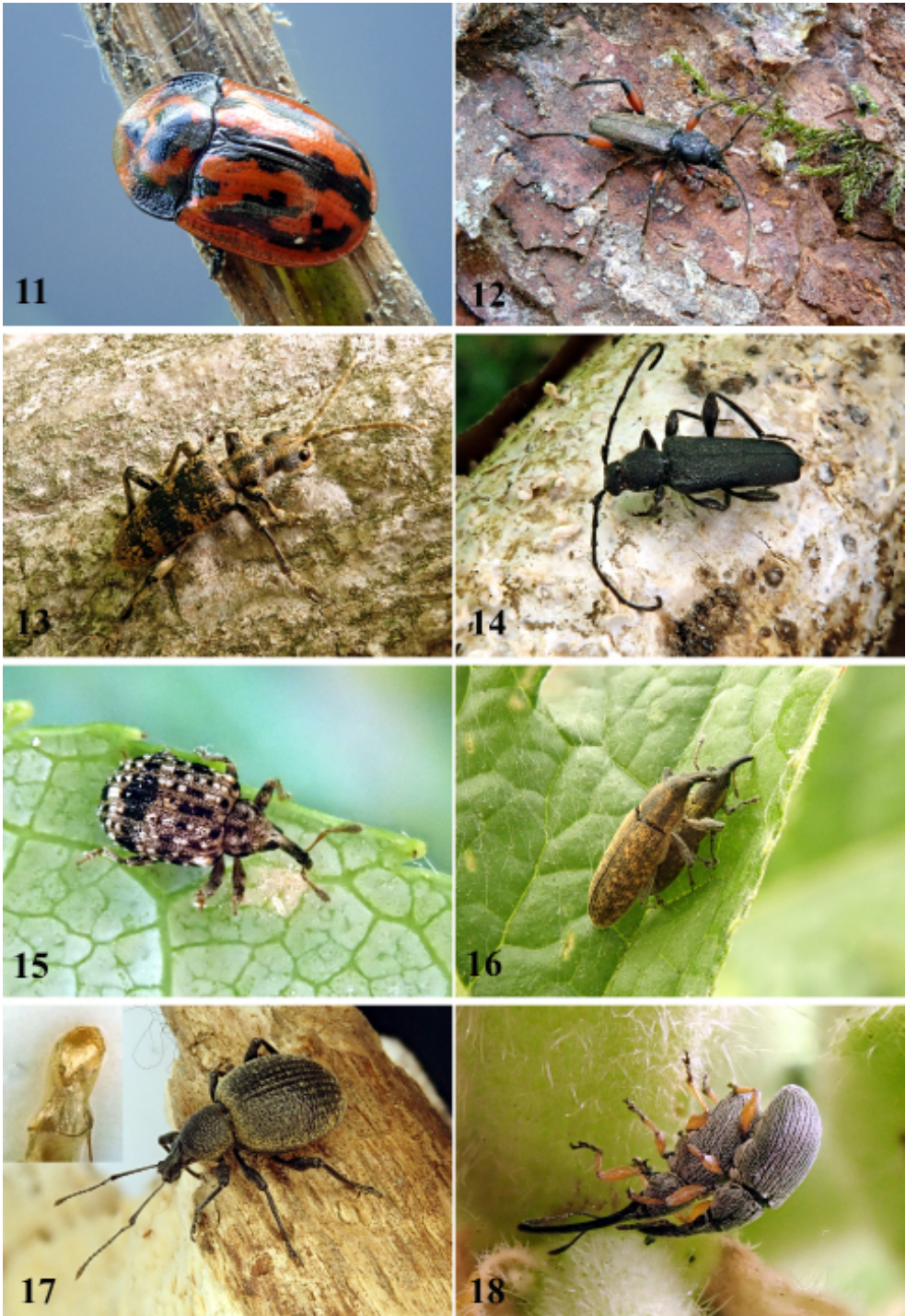
Figs 11–18. The photographs of the living specimens in nature (Kaliningrad Region): 11 – Pilemostoma fastuosum ; 12 – Palaeocallidium coriaceum ; 13 – Rhagium sycophanta ; 14 – Ropalopus macropus ; 15 – Cleopus pulchellus ; 16 – Lixus filiformis ; 17 – Otiorrhynchus armadillo , female (left box – aedeagus from collected specimen of 2020 year); 18 – Rhopalapon longirostre .